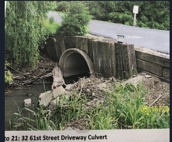
to 21: 32 61st Street Driveway Culvert